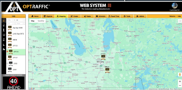
Easily map device locations & view messaging

The OPTRAFFIC online dashboard allows admins to easily track, manage, and edit message boards.